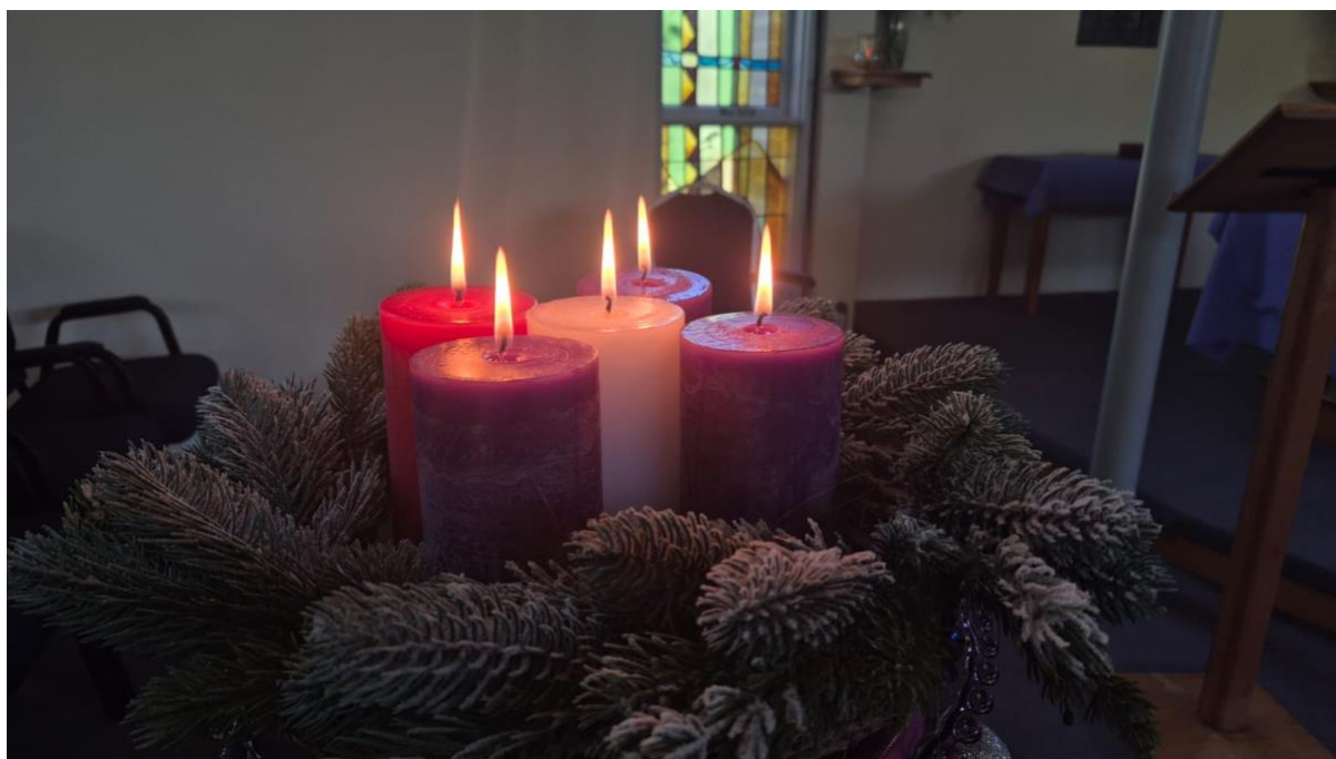
Photo of the current advent wreath at Holy Cross Chapel. The wreath was kindly donated by Pam Storey.